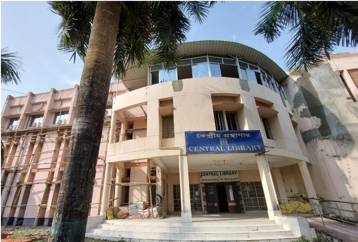
Central Library, KU