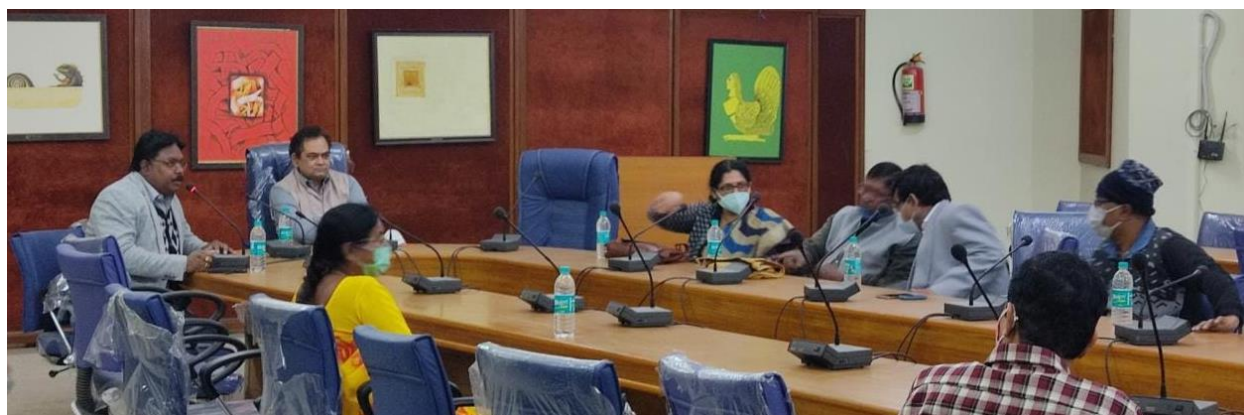
Parents-Teachers' Meeting on the occasion of Students' Day Celebration 2022 / January 02, 2022