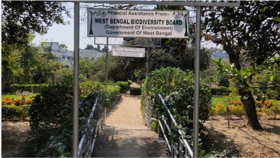
Kalyani University Biodiversity Educational & Conservation Park