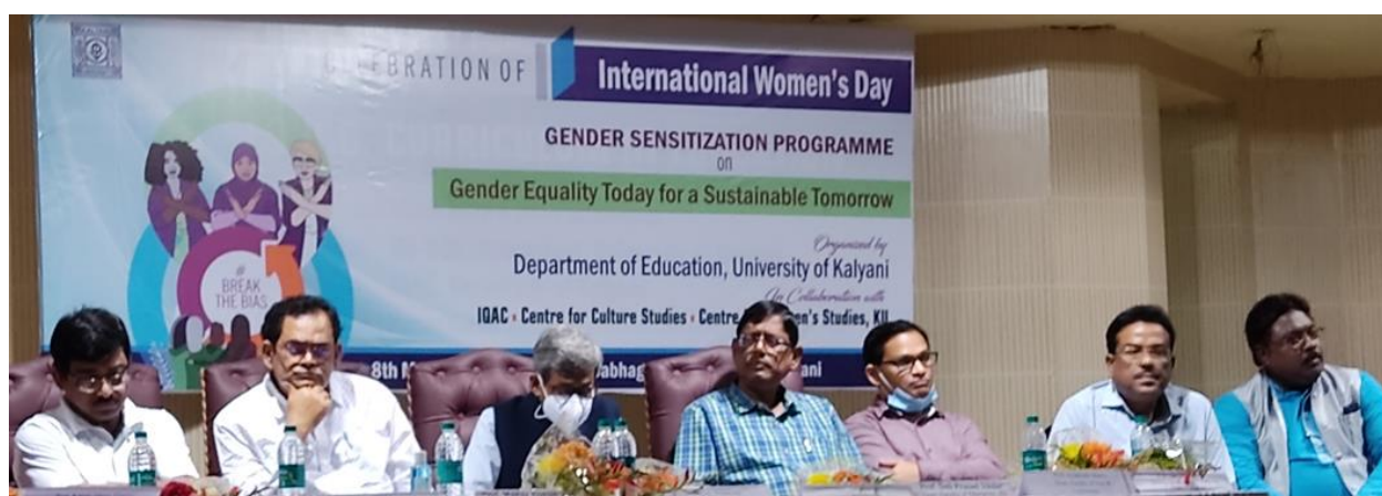
Inaugural Session of the International Women's Day on 'Gender Equality Today for a Sustainable Tomorrow', Organized by the Department of Education in collaboration with Centre for Culture Studies & IQAC on 8 th March, 2022.