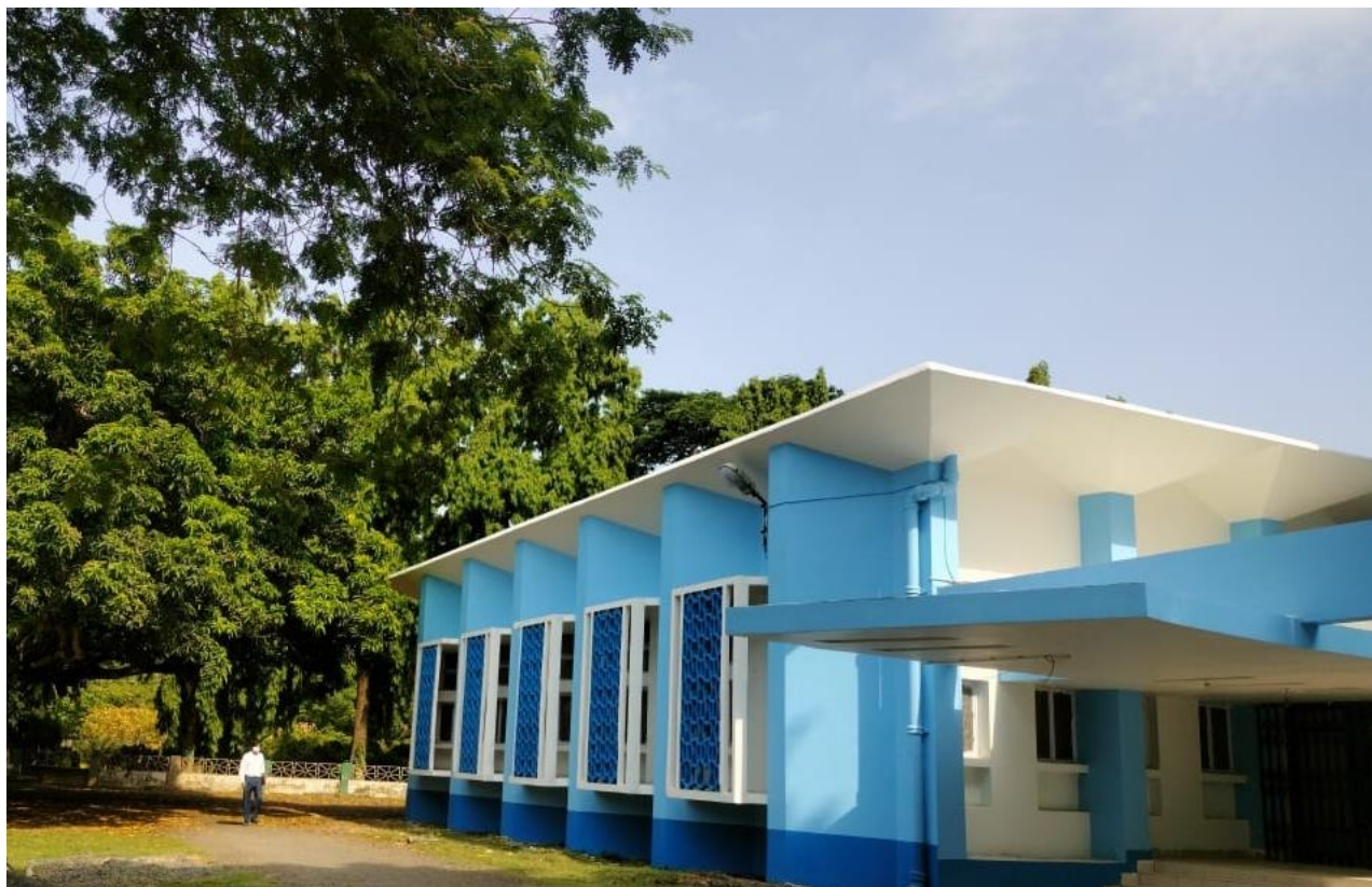
APC Hall, Administrative Building, KU