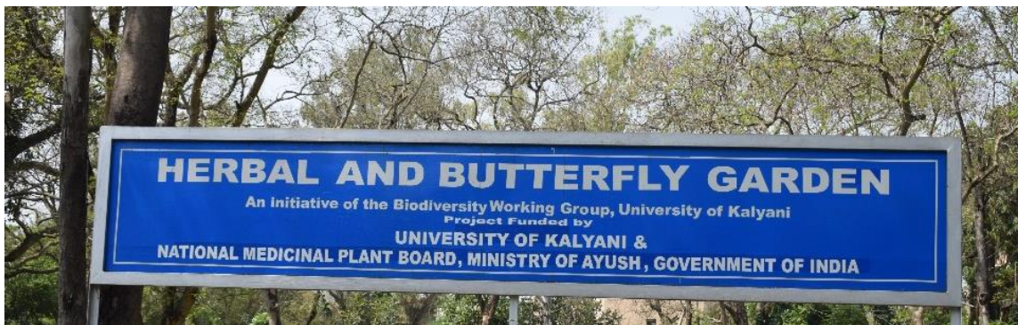
Kalyani University Herbal and Butterfly Garden