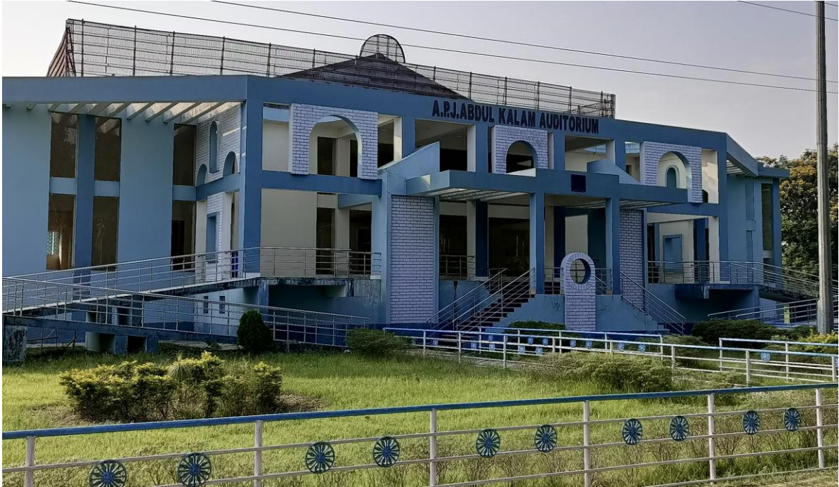
APJ Abdul Kalam Auditorium, KU