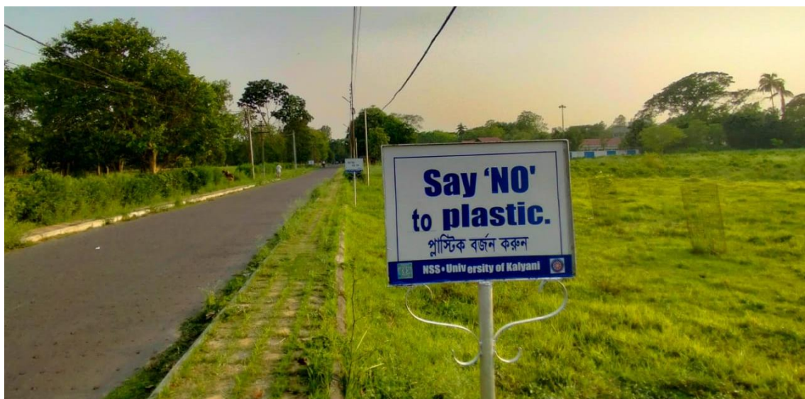
Plastic Free Green Campus, KU