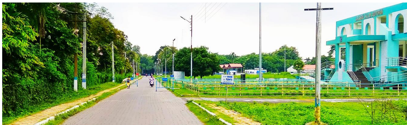
Kalyani University Campus: In front of APJ Abdul Kalam Auditorium