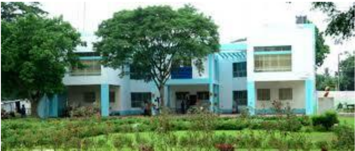
Centre for Information Resource Management (CIRM), KU