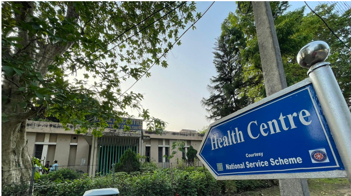
Health Centre, KU