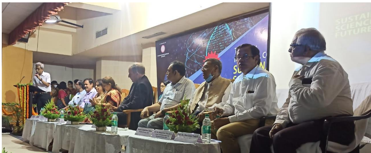
Inaugural Session of two-day National Conference on Sustainable Health Science for Future Generations, organized by the Department of Physiology in collaboration with the Science Congress Association (ISCA) on April 28-29, 2022.