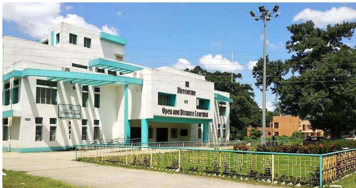
DODL Building, KU